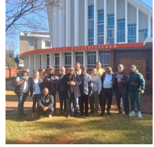
Wilberforce Academy Meets Our Kingdom Community