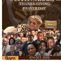
Mthwakazi Kingdom Thanksgiving and Prayer Day 4 October 2025