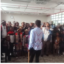
Umcimbi Wokuvala Unyaka ka 2025